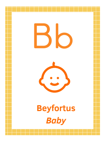
Infants should only receive Beyfortus (B is for "baby")