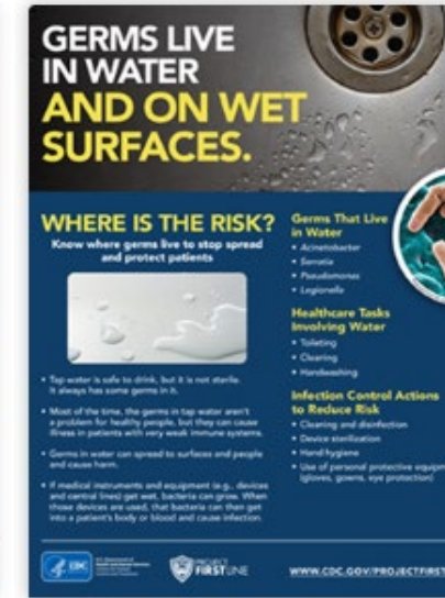
Water and Wet Surfaces Profile [PDF - 1 Page]