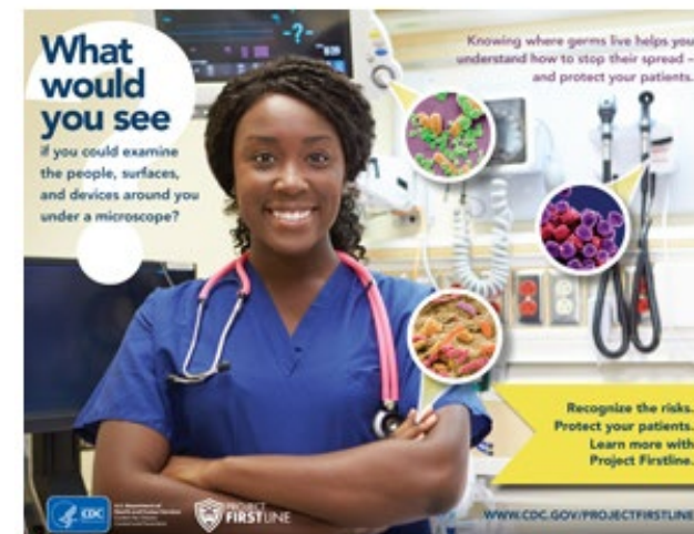
What would you see? Poster [PDF - 1 Page]