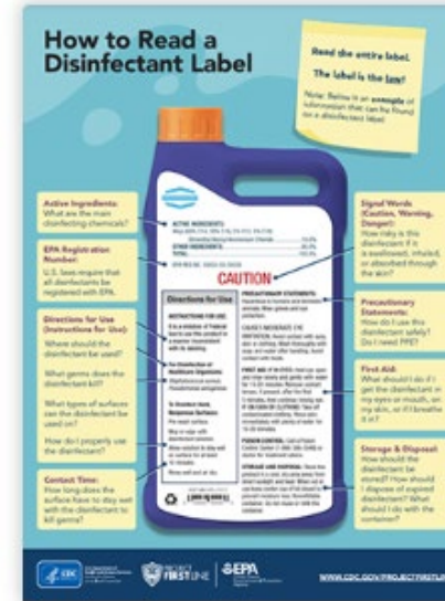
How to Read a Disinfectant Label [PDF - 1 Page]