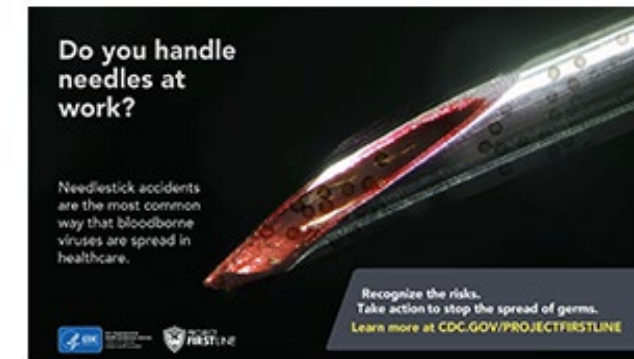
Germs live in blood [JPG - 1 Page]