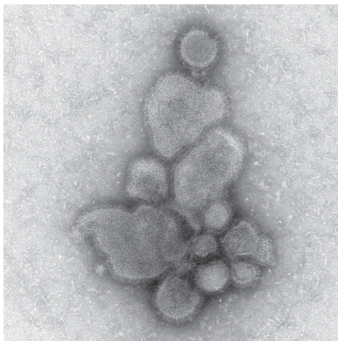
FIGURE 3. Electron micrograph image of influenza A/Anhui/1/2013 (H7N9), showing spherical virus particles characteristic of influenza virions — April 15, 2013

APHIS is working with the U.S. Department of the Interior to prepare a pathway assessment, using current literature, to assess evidence for potential movement of Eurasian avian influenza viruses into North America via wild birds. USDA is conducting animal studies to characterize the virus pathogenicity and transmission properties of this virus in avian and swine species. Preliminary results from studies performed on poultry by ARS in high-containment laboratories indicate that chickens and quail are showing no signs of illness but are shedding avian influenza A(H7N9) virus in these studies (Southeast Poultry Research Laboratory, unpublished data; 2013). ARS also has completed a preliminary antigenic