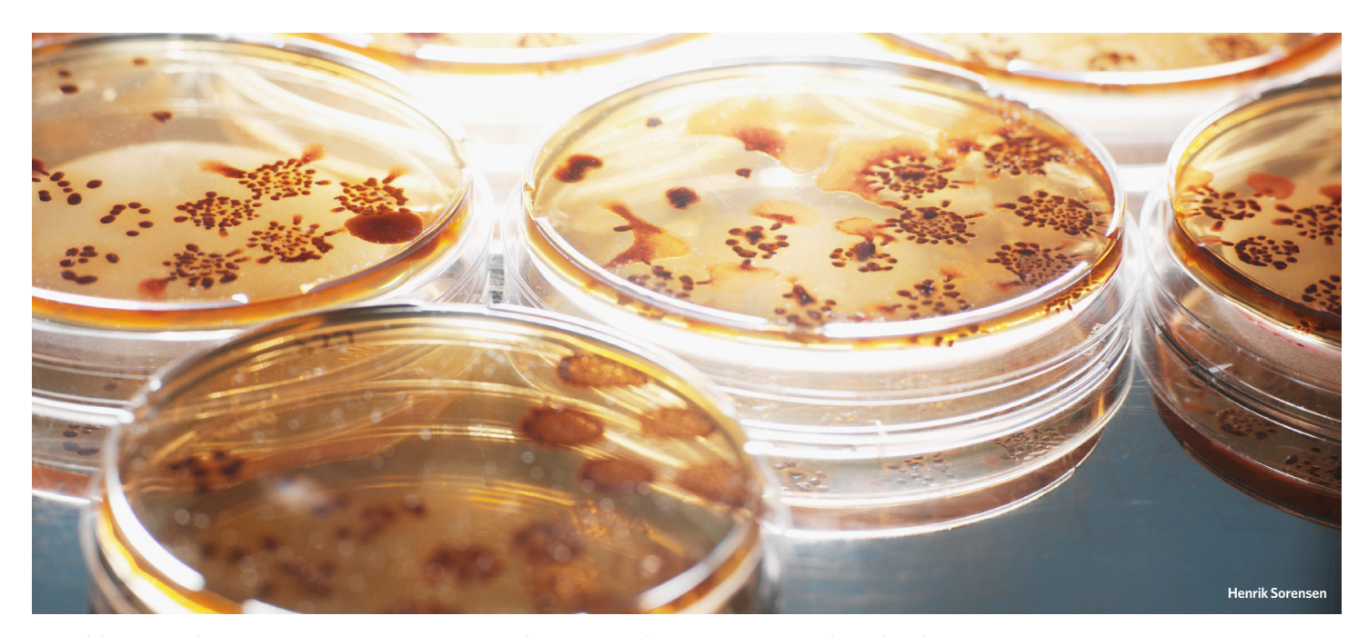
Campylobacter jejuni bacteria cause serious gastroenteritis and are increasingly resistant to commonly used antibiotics.