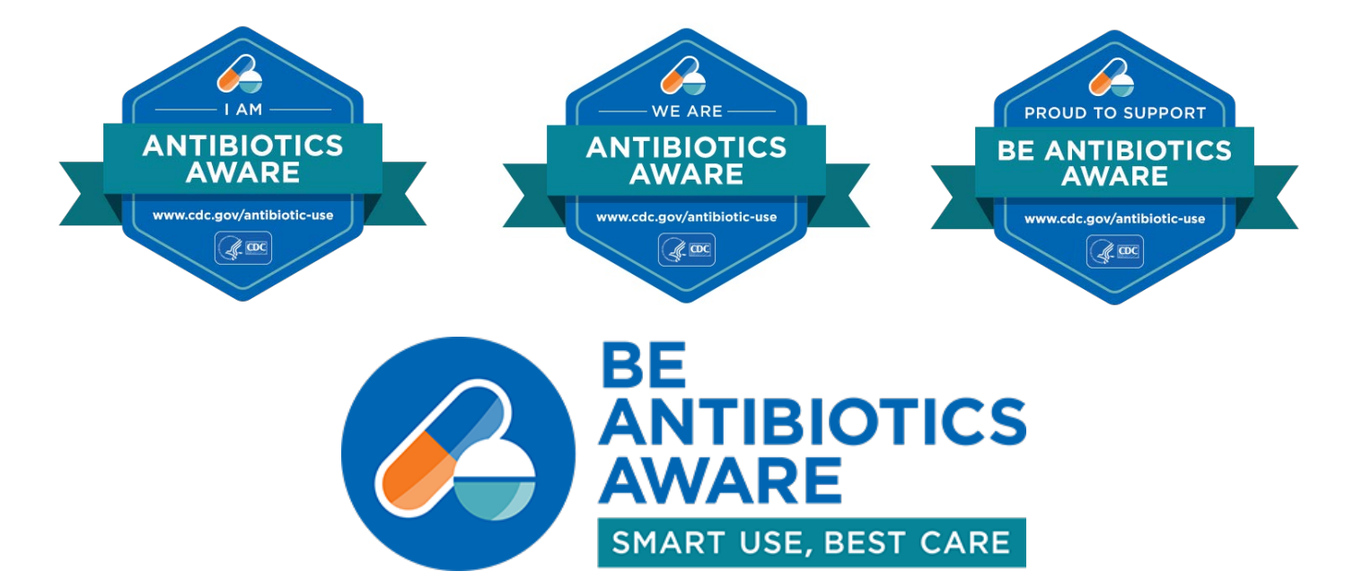
Figure 3: Sample options for commitment logo and flair

Thank you for your participation and commitment to the MITIGATE study.