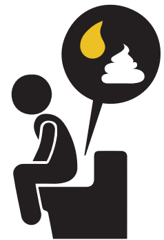
DARK URINE, PALE STOOLS & DIARRHEA