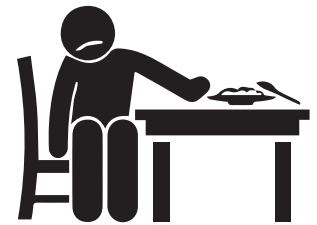
LOSS OF APPETITE